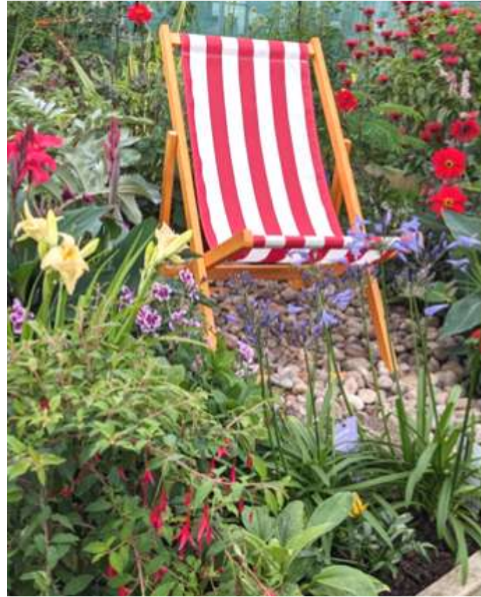
Combining these plants with the likes of Lavenders and Roses would make this flower bed feel very different