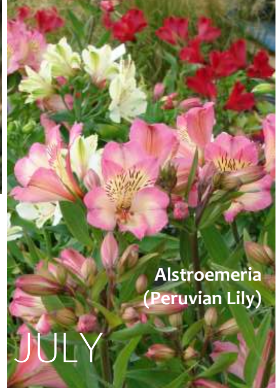
Alstroemeria (Peruvian Lily)